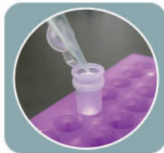
2. RNA Extraction